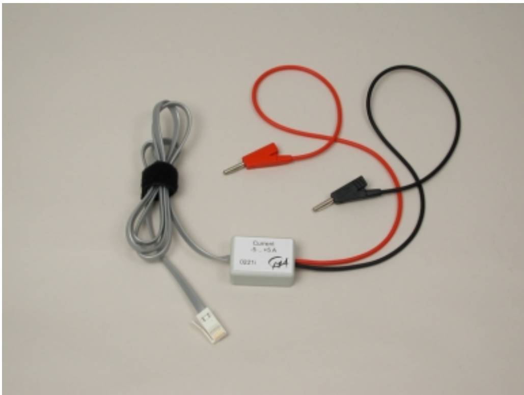
Figure 1. The Current Sensor - 5 .. +5 A